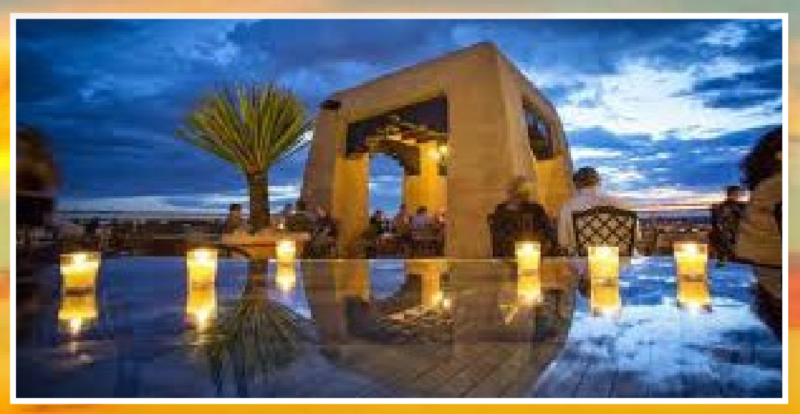
AMCA 2025 Americas Region Meeting and Idea Exchange Conference